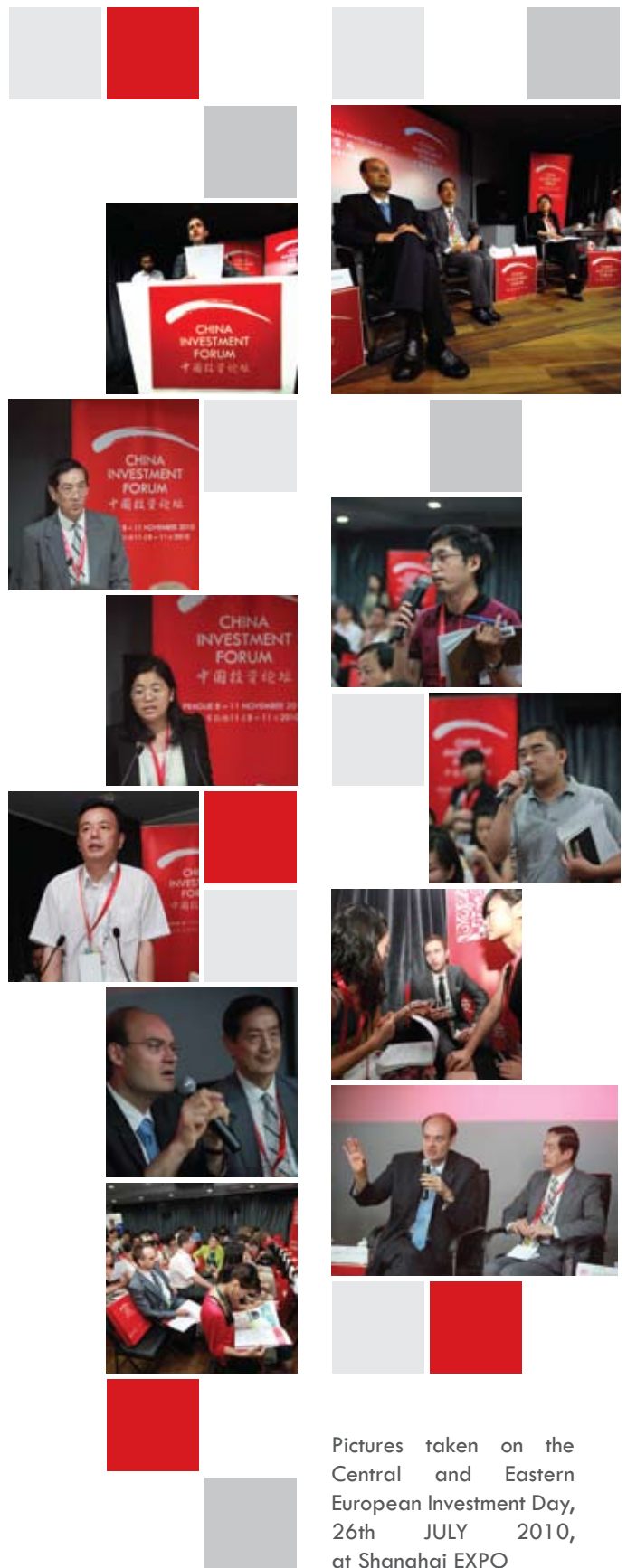
Pictures taken on the Central and Eastern European Investment Day, 26th JULY 2010, at Shanghai EXPO

For more information and registration visit www.cif2010.com .